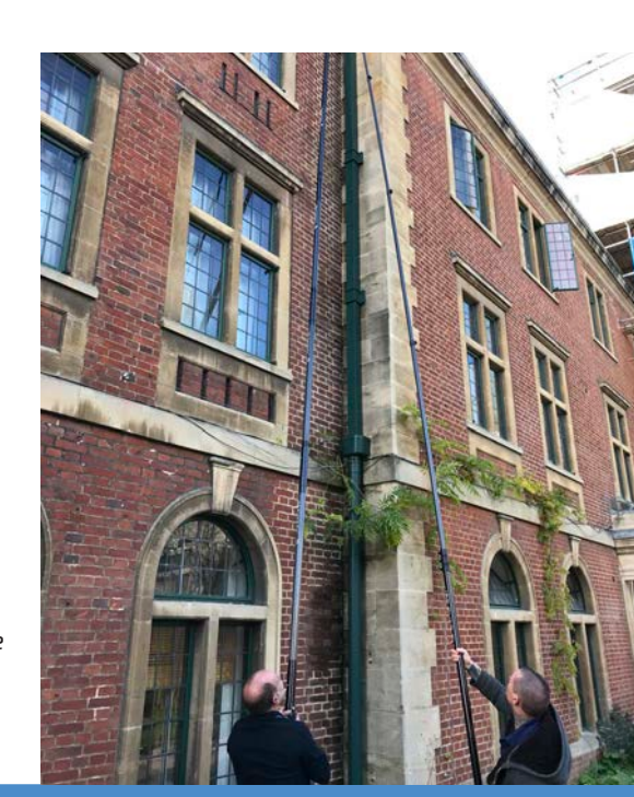
: The World's Leading High-Level Cleaning System

As if all of this innovation wasn't enough, all of SpaceVac's cleaning poles, heads, brushes and tools feature our unique safety locking mechanism for total operator safety. Designed to ensure the system does not separate during operation - this development is just the latest innovation in the development of SpaceVac.