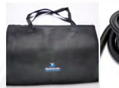
SV/MB 1 x Mesh Bag