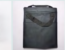
SV/HB 1 x Hose Bag