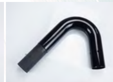
SV38/135H 1 x 135 Degree Cleaning Head