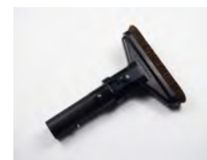
SV38/8SW 1 x 17cm Small Flexi Brush Horse Hair