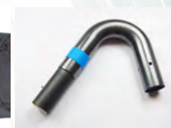
SVA38/135H 1 x Conductive 135 Degree Head