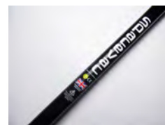
5 x SVA38/16-PRO 5 x 38mm x 1.6m Atex Pro Pole

Each 38mm SpaceVac Food Safe system comes with the following items included as standard: