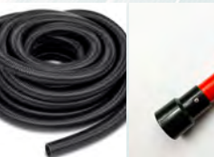
SV50/75H 1 x Hose 7.5m