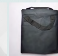
SV/HB 1 x Hose bag