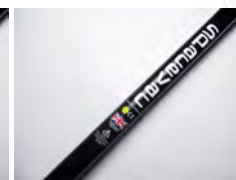
SVA38/08-PRO 1 x 38mm x 0.8m Atex Pro Half Pole