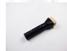
SV38/GHB 1 x Small Goat Hair Brush [Very Soft]