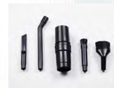
SV38/MTK 1 x 8 Piece Micro Tool Kit [Inc. 38mm Hose Adapter And Bag]