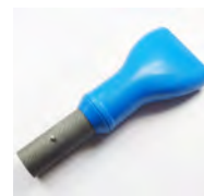
SVA38/FSGN 1 x Anti Static Gulper Tool