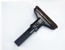
SV38/8SW 1 x 17cm Small Flexi Brush