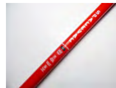
6 x SV50/14-HV 6 x 1.4m" x Non Conductive 50mm High Voltage Poles

Each 50mm SpaceVac High Voltage system comes with the following items included as standard: