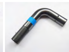
SVA38/90H 1 x Conductive 90 Degree Head