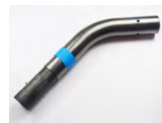
SVA38/45H 1 x Conductive 45 Degree Head