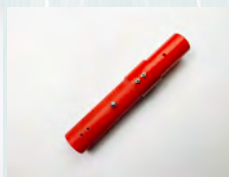
SV50/HVPA 1 x 50mm to 38mm Adaptor