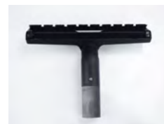
SV38/FLT 1 x Flat Surface Tool