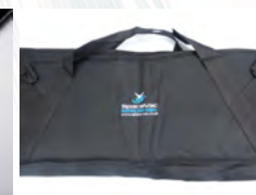
SV/PB 1 x Padded Pole bag