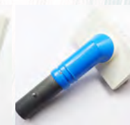
SVA38/FSREC 1 x Anti Static Rectangular Brush