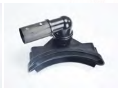
SV38/12DB 1 x 30cm Ducting Brush