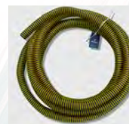
SVA38/10H 1 x Conductive Hose x 10m