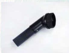
SV38/SRB 1 x Small Round Brush