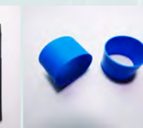
SV/SB-* 10 x Silicon Bands