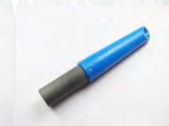
SV38A/FSCONE 1 x Anti Static Nozzle Tool