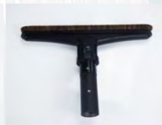
SV38/15SW 1 x 38cm Large Flexi Brush