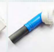
SV38A/FSRB 1 x Anti Static Round Brush