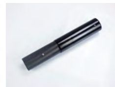
SV38/STR 1 x Straight Cleaning Head