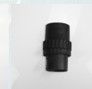
SVA38/50HC 1 x Conductive 38mm Vac Inlet Cuff