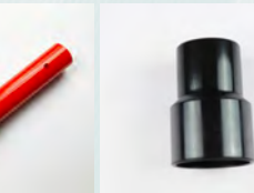
SV50/HVHA 1 x Hose to Pole adaptor