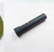
SVA38/HA 1 x Conductive 38mm Hose to pole adaptor