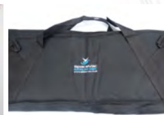
SV/PB 1 x Padded Pole bag