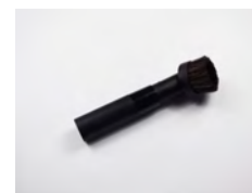
SV38/SHHB 1 x Small Round Horse Hair Brush [Soft]

Each SpaceVac Museums system comes with the following items included as standard: