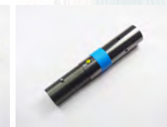
SVA38/STR 1 x Conductive Straight Cleaning Head