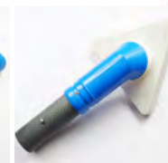
SVA38/FSTB 1 x Anti Static Triangular Brush