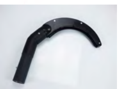
SV38/8PB 200mm Pipe Brush