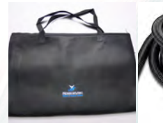
SV/MB 1 x Mesh Bag