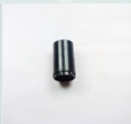
SV38/50HC 1 x 38mm Vac Inlet Cuff