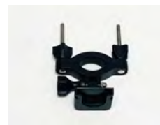
2 x SVCAM-CLAMP 2 x Camera and Monitor Tube Clamp