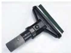
SV38/8WT 17cm Small Water Removal Tool