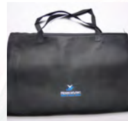
SV/MB 1 x Mesh Bag