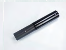
SV38/STR 1 x Straight Cleaning Head