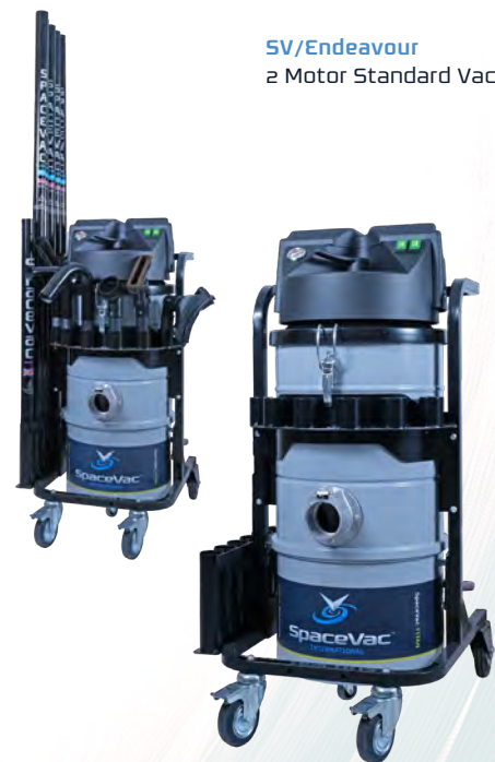
SV/Endeavour 2 Motor Standard Vac

The SpaceVac Endeavour is a powerful twin motor vacuum cleaner for excellent suction and easy removal of high-level dust and dirt from internal settings.