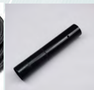
SV38/HA 1 x Hose to Pole Adaptor