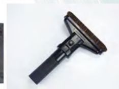
SV38/85W 1 x 17cm Small Flexi Brush