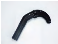
SV38/4PB 100mm Pipe Brush