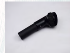
SV38/SRB 1 x Small Round Brush

Don't Forget: All of our SpaceVac cleaning systems can be accessorised with a range of add-on tools and accessories - be sure to check our accessories and add-ons section for more information.