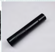
SV38/HA 1 x Hose to Pole Adaptor