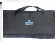
SV/PB 1 x Padded Pole Bag