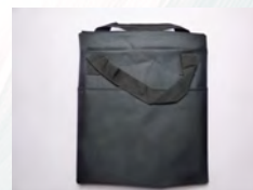
SV/HB 1 x Hose Bag