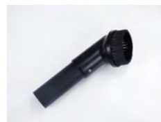
SV38/SRB 1 x Small Round Brush