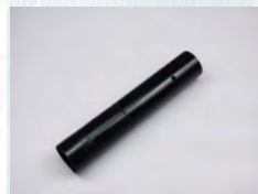
SV38/HA 1 x Hose to Pole Adaptor