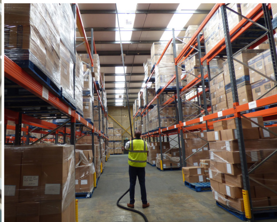
SpaceVac High-Level Cleaning Systems Internal Cleaning Systems 2021