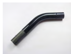
SV38/45H 1 x 45 Degree Cleaning Head