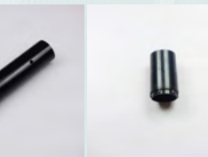
SV38/HA 1 x Hose to Pole Adaptor