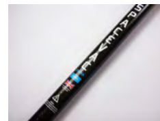
9 x SV38/16-Ultra 9 x 38mm x 1.6m Ultra Poles

Each 38mm SpaceVac Ultra system comes with the following items included as standard: