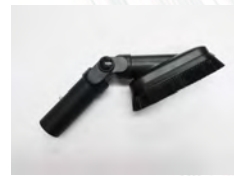
SV38/MAB 38mm Multi Angle Brush