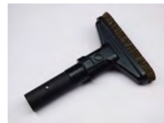
SV38/85W 1 x 17cm Small Flexi Brush