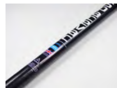
3 x SV38/16-Pioneer 3 x 38mm x 1.6m Pioneer Pole

Each 38mm SpaceVac Pioneer system comes with the following items included as standard: