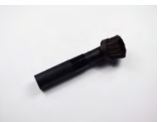
SV38/SHHB Small Round Horse Hair Brush [Soft]