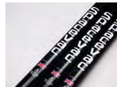
3 x SV38/125-LITE 3 x 38mm x 1.25m LITE Pole

Each 38mm SpaceVac Lite system comes with the following items included as standard: