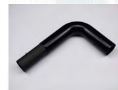
SV38/90H 1 x 90 Degree Cleaning Head