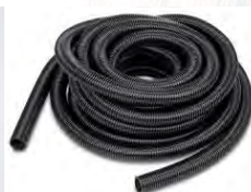
SV38/3H 1 x 3m Hose