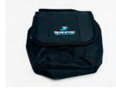
SV/CB 1 x Camera Bag