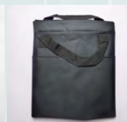
SV/HB 1 x Hose Bag