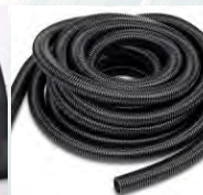
SV38/5H 1 x 5m Hose