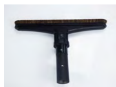
SV38/15SW/SYN 38cm Large Flexi Brush with soft bristles