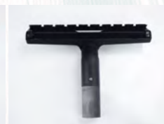
SV38/FLT 1 x 300mm Flat Surface Tool