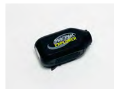
SVCAM-EXPLORER Waterproof Explorer Camera

Each SpaceVac Explorer system comes with the following items included as standard: