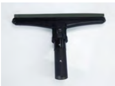
SV38/15WT 38cm Large Water Removal Tool