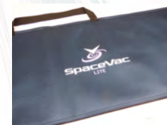
SV/LPB 1 x Lite Pole Bag