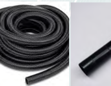
SV38/5H 1 x 5m Hose