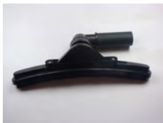
SV38/48DB 121cm Ducting Brush