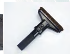
SV38/85W 1 x 17cm Small Flexi Brush