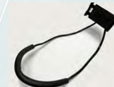
SVCAM-FLEXIHOLDER 1 x Flexible neck Bracket