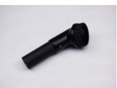
SV38/MRBSOFT Medium Round Brush with Soft Bristles