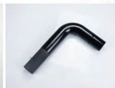
SV38/90H 1 x 90 Degree Cleaning Head