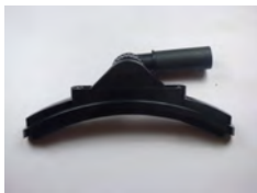
SV38/24DB 60cm Ducting Brush