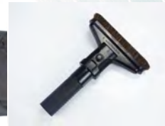
SV38/85W 1 x 17cm Small Flexi Brush