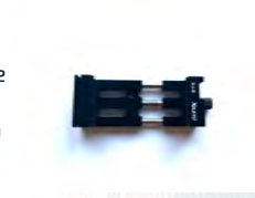
SVSCREEN-MOUNT 1 x Camera Mount