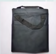
SV/HB 1 x Hose Bag