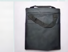
SV/HB 1 x Hose Bag