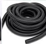
SV38/5H 1 x 5m Hose