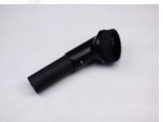
SV38/MRBSOFT Medium Round Brush With Stiff Bristles