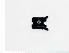
2 x SV/CC 2 x Camera and Monitor Quick Release Clip