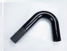
SV38/135H 1 x 135 Degree Cleaning Head