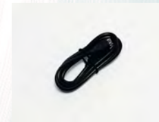
SV/DC 1 x Data Cable