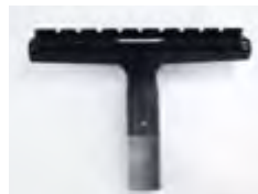
SV38/FLT 38mm Flat Surface Tool With No Swivel