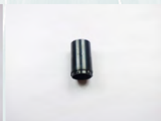
SV38/50HC 1 x 38mm Vac Inlet Cuff