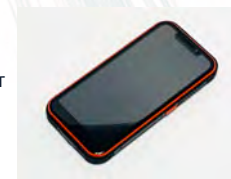
SVCAM-OBSERVER 1 x Phone Monitor