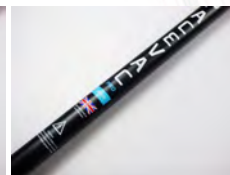
SV38/08-Pro 1 x 38mm x 0.8m Pro Half Pole