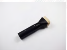
SV38/GHB Small Goat Hair Brush [Very Soft]