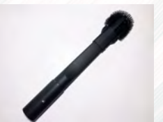
SV38/CB 38mm Crevice Nozzle with Brush