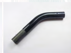
SV38/45H 1 x 45 Degree Cleaning Head