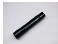
SV38/32HA 1 x 32mm Hose to Pole Adaptor