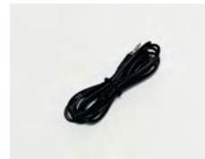
SV/USB 1 x USB Cable