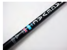
7 x SV38/16-Pro 7 x 38mm x 1.6m Pro Pole

Each 38mm SpaceVac Pro system comes with the following items included as standard: