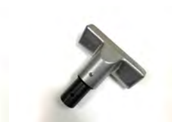
SV50/AMT Aluminium Moss Cleaning Tool