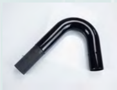
SV38/135H 1 x 135 Degree Cleaning Head