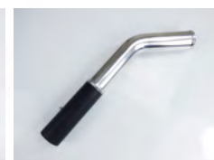
SV50/45H 45 Degree Aluminium Cleaning Head