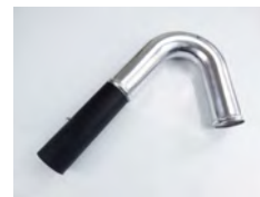
SV50/135H 1 x 135 Degree Head