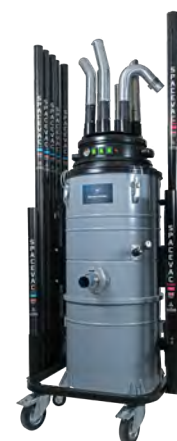
SV/Hurricane 3 Motor Standard Vac

The SpaceVac Hurricane is a brand new, custom designed triple motor wet/dry vacuum capable of delivering powerful cleaning performance inside or out.