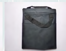
SV/HB 1 x Hose Bag