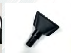
SV50/RN Plastic Moss Cleaning Tool