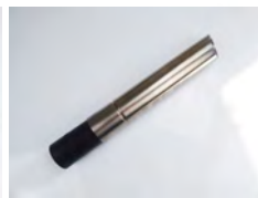
SV50/50ST 1 x 50mm Spike Tool