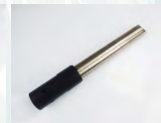
SV50/38ST 1 x 38mm Spike Tool