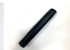
SV50/50ST-CO Composite Gutter Spike Tool