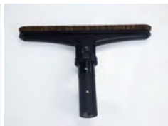
SV38/15SW 1 x 38cm Large Flexi Brush