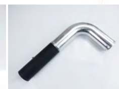
SV50/90H 90 Degree Aluminium Cleaning Head