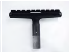
SV38/FLT 1 x 300mm Flat Surface Tool