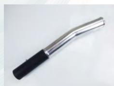
SV50/15H 15 Degree Aluminium Head