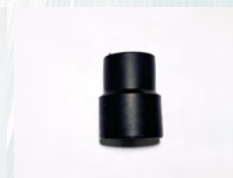
SV50/50HC 1 x 50mm Vac Inlet Cuff