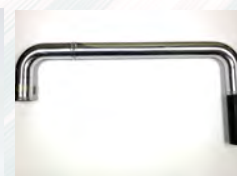
SV50/BGH Box Gutter Head