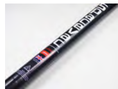
6 x SV50/16-Classic 6 x 50mm x 1.6m Classic Pole

Each 50mm SpaceVac Universal system comes with the following items included as standard: