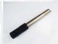
SV50/38ST 1 x 38mm Spike Tool