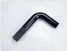
SV38/90H 1 x 90 Degree Cleaning Head