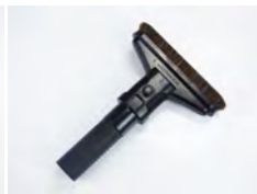
SV38/8SW 1 x 17cm Small Flexi Brush