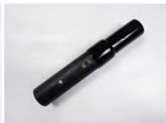
SV50/38PA 1 x 50mm to 38mm Adaptor