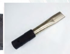
SV50/38CT 1 x Crevice tool