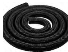
SV50/75H 1 x Hose x 7.5m