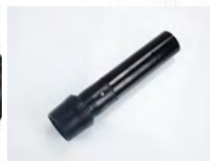
SV50/HA 1 x 50mm Hose to Pole Adapter