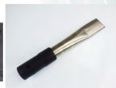
SV50/38CT 1 x Crevice tool