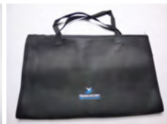
SV/MB 1 x Mesh Bag